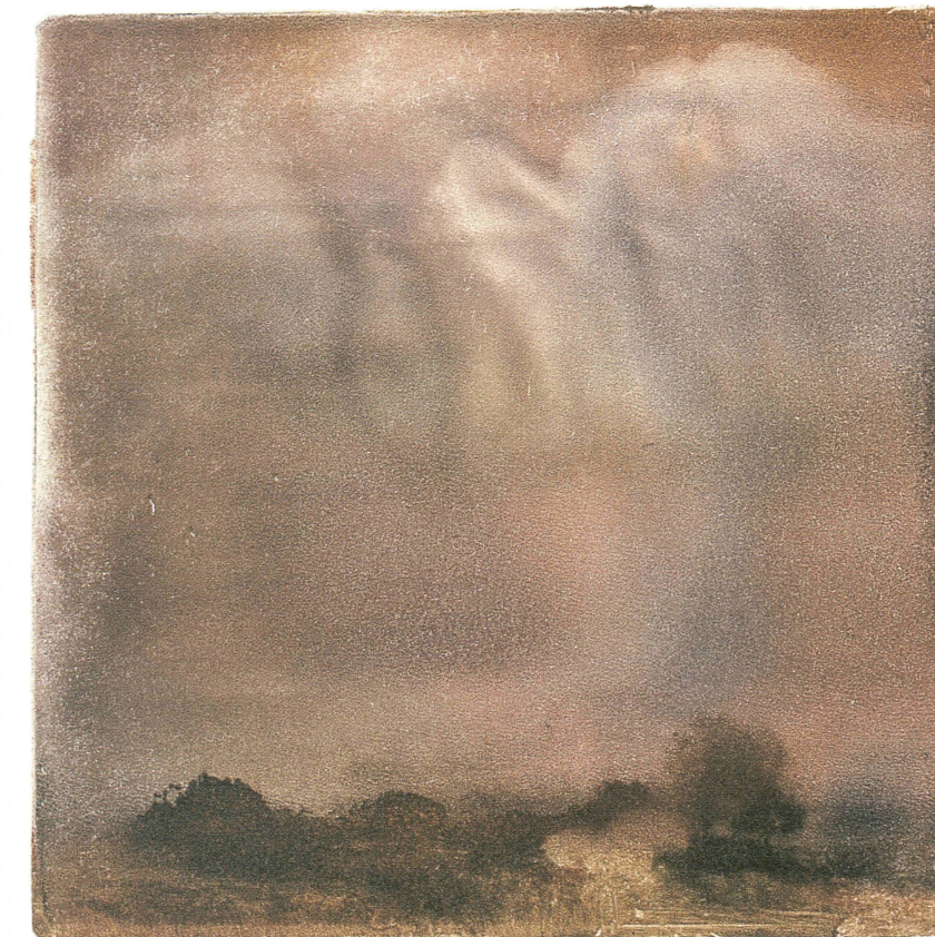
One Path Leading Away 3½" x 3¼" 1994