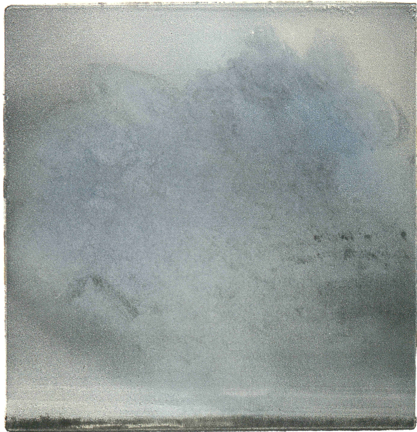
Come Fly with Me 7½" x 7" 1995