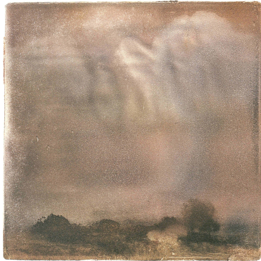
One Path Leading Away 3½" x 3¼" 1994