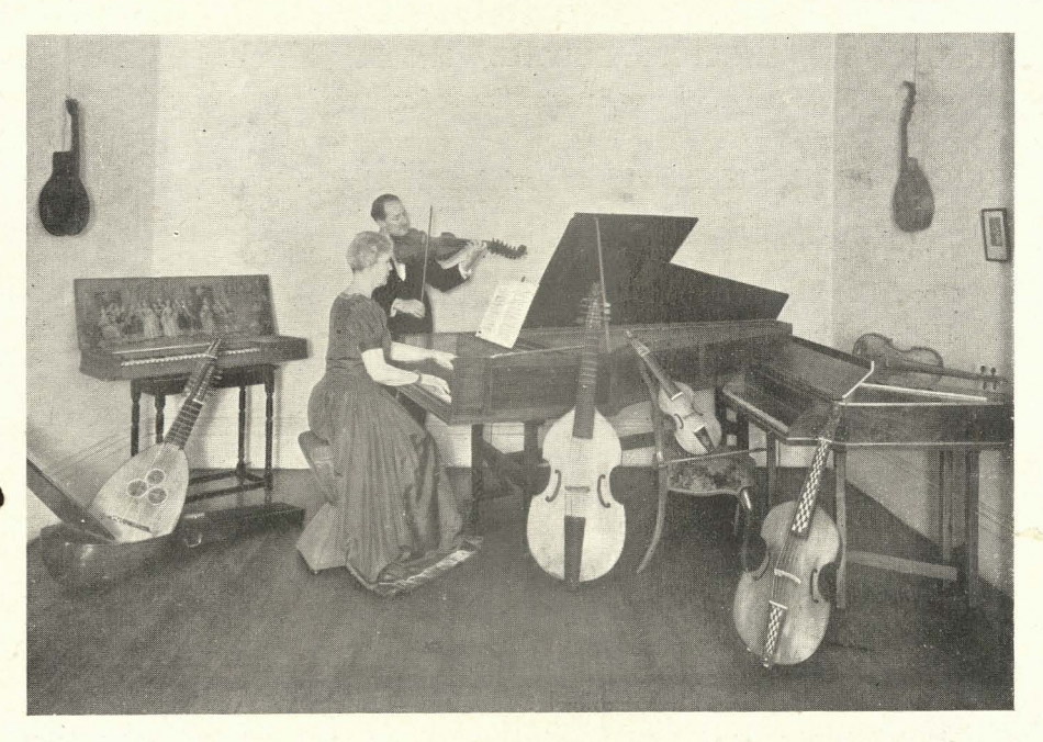
Instruments from the collection of