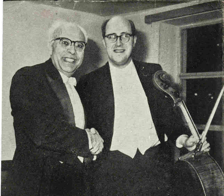
MICHAELIDES WITH ROSTROPOVICH