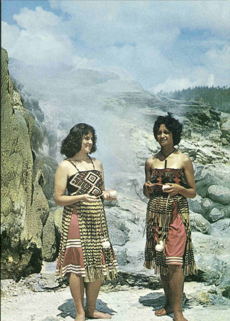
MAORI GIRLS IN TRADITIONAL COSTUME, N.Z.