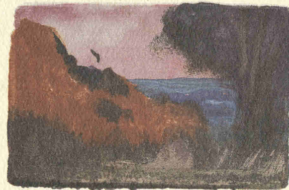
An Excess of Memory , 1990. Monotype. Image Size 3 x 2"

But what do I love when I love my God? Not material beauty or beauty of a temporal order; not the brilliance of earthly light, so welcome to our eyes; not the sweet melody of harmony and song; not the fragrance of flowers, perfumes and spices; not manna or honey; not limbs such as the body delights to embrace. It is not these that I love when I love my God. And yet, when I love him, it is true that I love a light of a certain kind, a voice, a perfume, a food, an embrace; but they are of the kind that I love in my inner self, when my soul is bathed in light that is not bound by space; when it listens to sound that never dies away; when it breathes fragrance that is not borne away on the wind; when it tastes food that is never consumed by eating; when it clings to an embrace from which it is not severed by fulfillment of desire. That is what I love when I love my God.